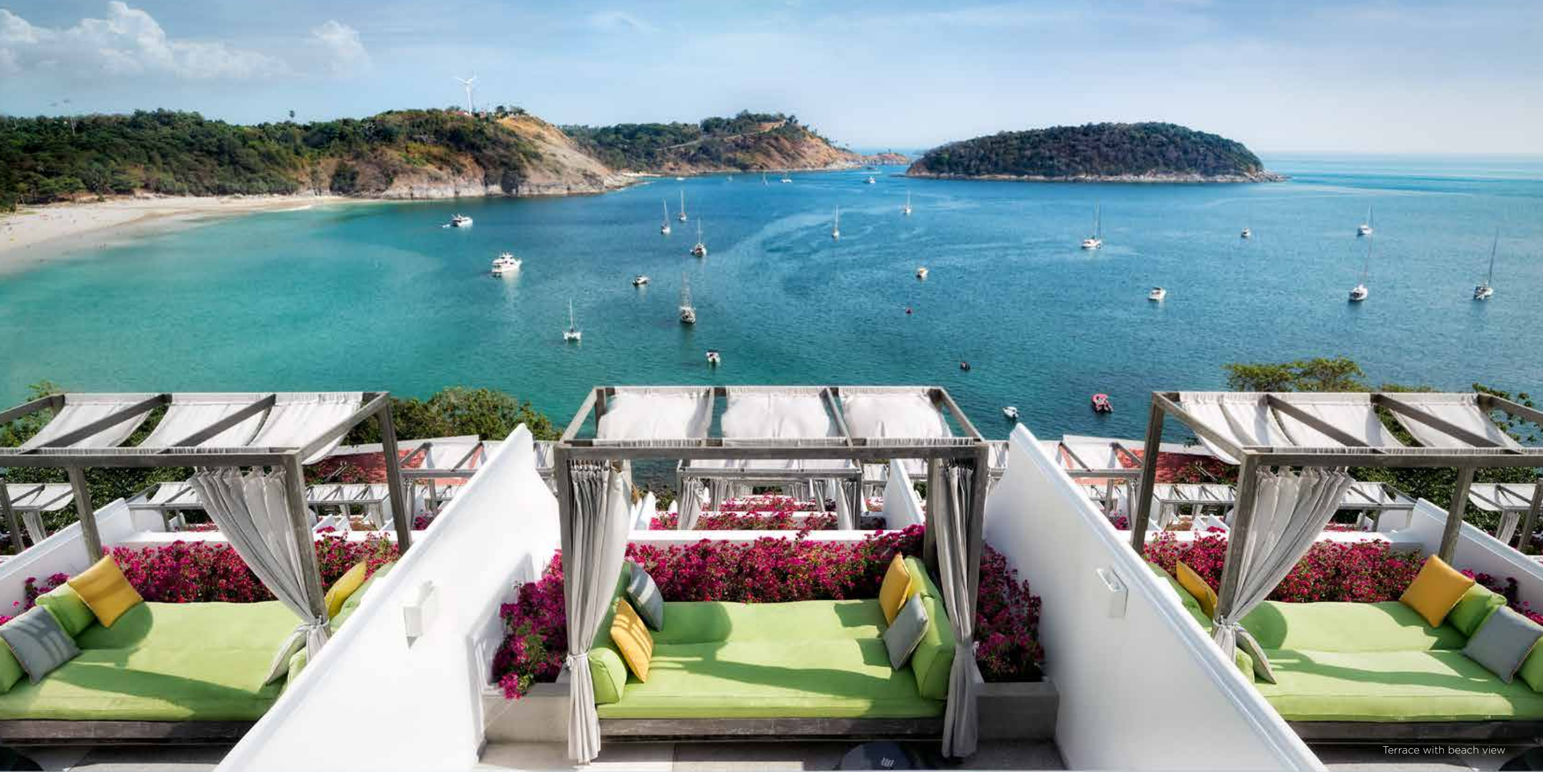
Terrace with beach view