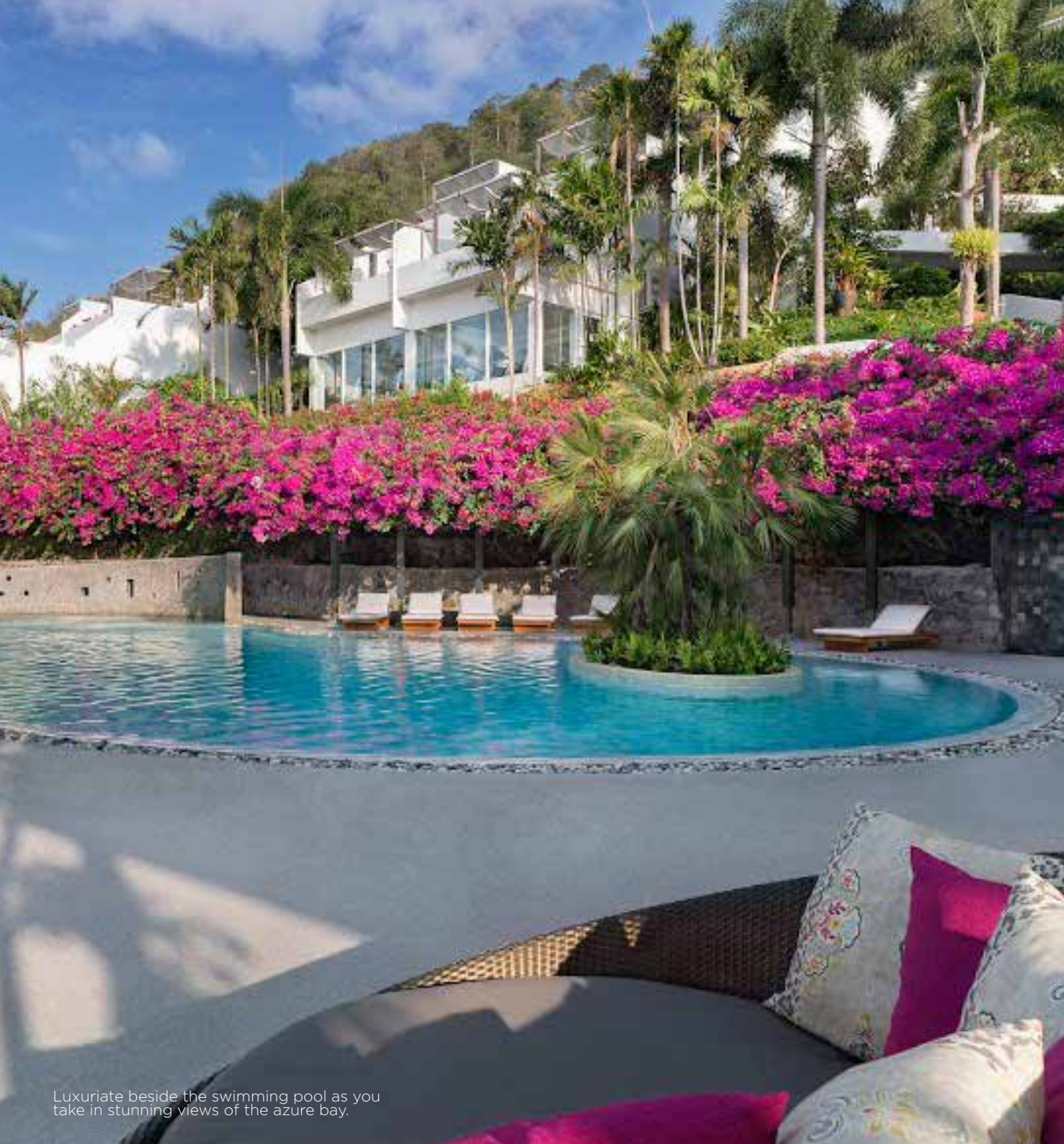
Luxuriate beside the swimming pool as you take in stunning views of the azure bay.