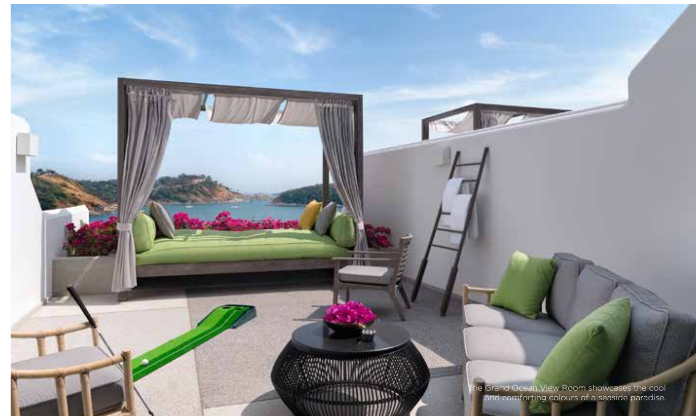
The Grand Ocean View Room showcases the cool and comforting colours of a seaside paradise.