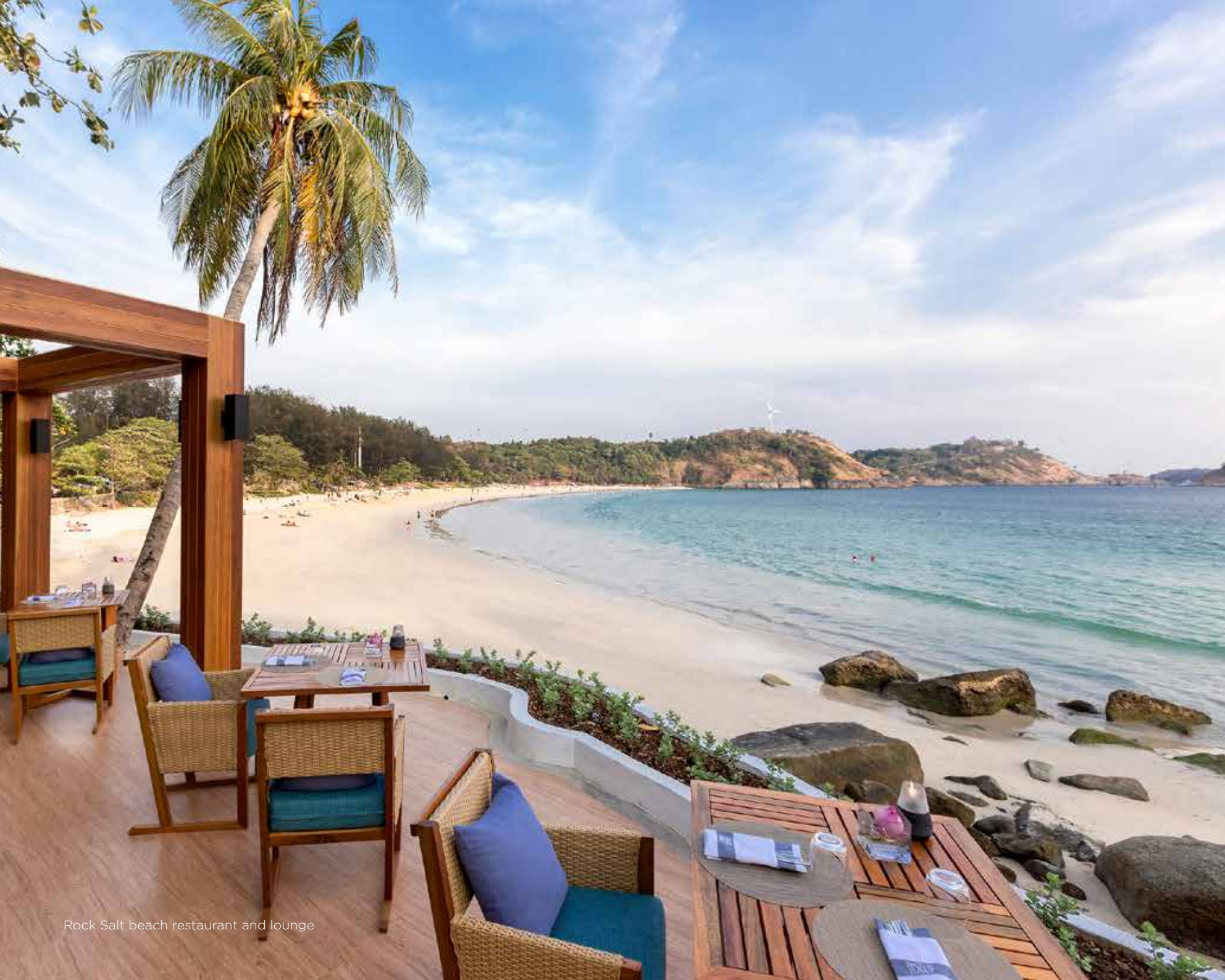
Rock Salt beach restaurant and lounge